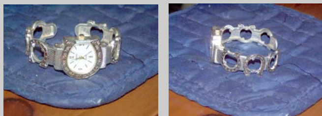
(Item #3) Woman's Horseshoe Watch

This beautiful woman's watch was donated by a member from Philadelphia. It has an adjustable band, horseshoes around the wrist and the face of the watch.