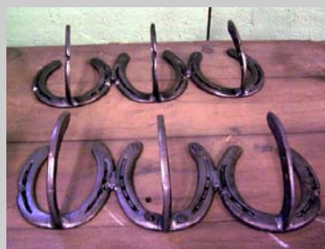
(Item #6) Horseshoe Wall Rack

Three small horseshoes are welded together to make this 14" x 5" wall rack.