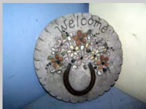
(Item #5) Handmade Hshoe Stepping Stone

This 12" diameter stepping stone is an actual horseshoe imbedded in concrete with stones to make it look like a flower pot. We use this as a "Welcome" stone at our club courts.