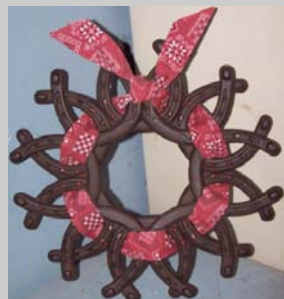
(Item #2) Wreath made out of horseshoes

We hang this 14" wreath on the door of our club, and change the fabric (just use bandannas) depending on the season.